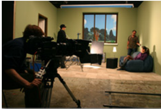
Dancing with Light black-and-white workshop