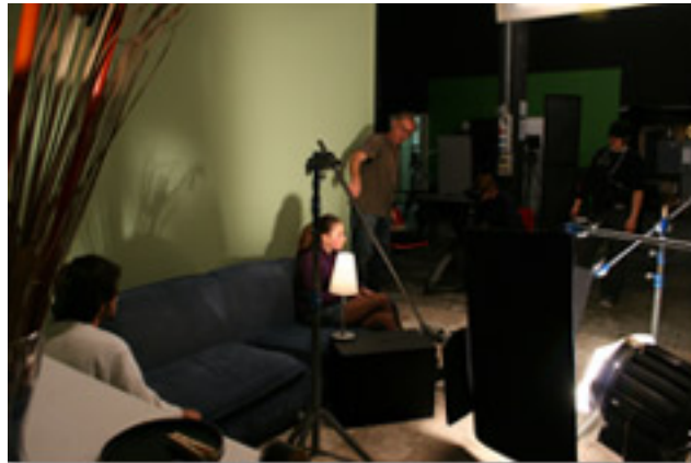
Dancing with Light black-and-white workshop

"A Dancing with Light -designed cinematic sequence needs to be organic if it is to relate to the emotional and/or the intellectual content of a scene," states Sikora. "This can only be achieved when elements chosen for visual interpretation are psychologically motivated and are of a homogeneous nature.